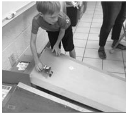
STEAM FORCE & MOTION