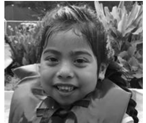
WATER PARK FUN