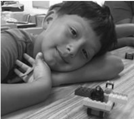
STEAM TRANSPORTATION CREATION